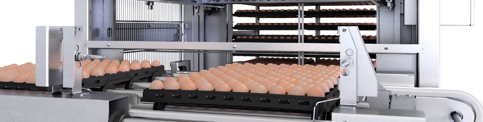
Transfer of setter trays into setter trolley